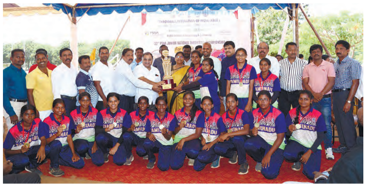
TN girls team, winners of the 32nd Junior National Throwball Championship.